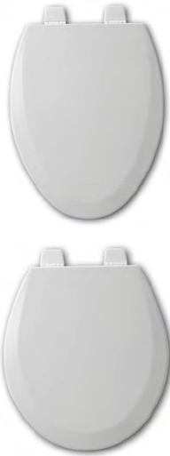
Elongated White - Closed Front w/ Cover #62424