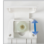
3/8" ADJUSTABLE HINGES